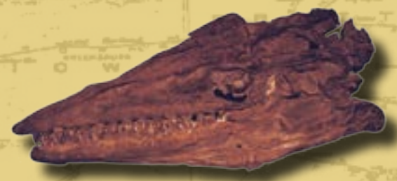
Oakley—the “Fossil Capital of Kansas”

For information: Oakley Area Chamber of Commerce 313 Center Avenue Oakley, KS 67748 (785) 672-4862 www.discoveroakley.com email:oakleycc@ruraltel.net